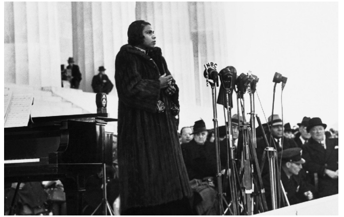
Marian Anderson at the Lincoln Memorial