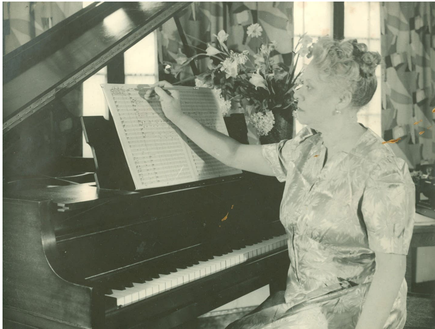
Florence Price at the Piano